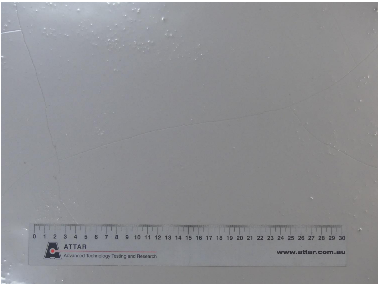
Figure 1: Fosroc Nitoflor FC150 HP-FC + Fosroc Nitoflor FC150 HP-FC.