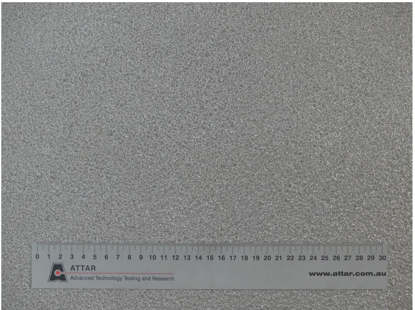
Figure 1: Fosroc Nitoflor FC150 HP + Fosroc Nitoflor Anti-Slip Grains 01 Silica Sand 16/30# + Fosroc Nitoflor FC150 HP.